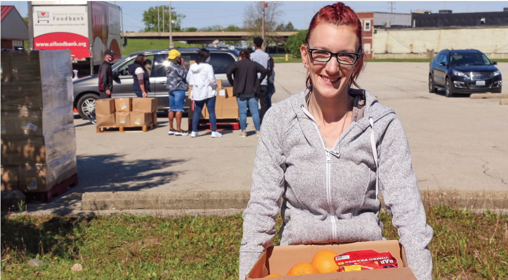
Thanks to your support, April can pick up a box full of healthy food whenever her cupboards are empty.

Please see page 8 to help more neighbors like this devoted mom and educator! You can make the holidays special for local families facing hunger with another generous gift today.