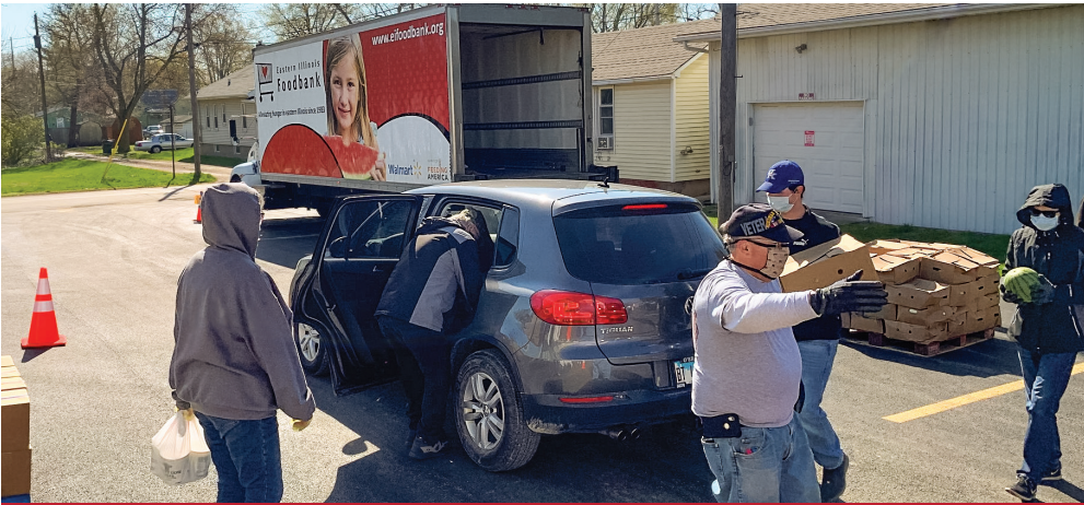
Your support helps us organize safe drive-through food distributions in 18 counties.